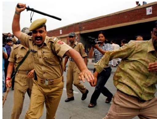
Figure 13.1 The Law and Police Forces Play an Active Role in Enforcing Social Control

Informal means of social control are exercised by informal institutions like family, peer group, neighborhood, etc. These are discussed below: